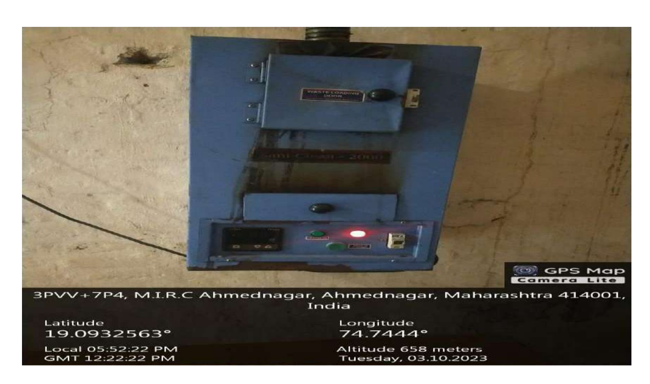
Sanitary Pad Disposal Machine